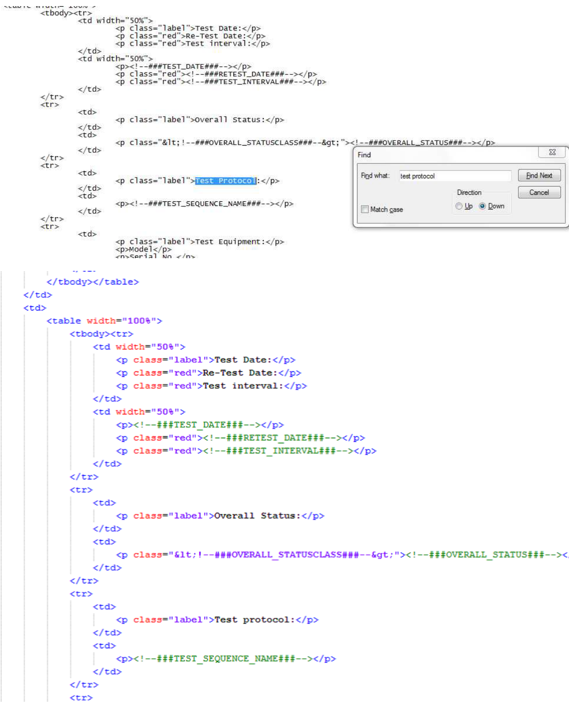
Figure 4: Notepad++ word editing

6) Then open Med-eBase, select the test asset you want to print and then select the print icon. This takes you to the certificate screen where the dropdown menu for templates should include your customised template